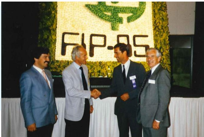
FIP congress, Montreal, Canada (1985)

Then, in 1985, the FIP congress was held in Montreal, Canada, and in 1988, the annual congress was held in Australia, becoming the first congress south of the equator and opening the door to future events in distant destinations.